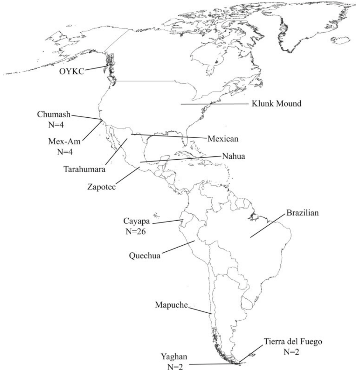
Fig. 1. Map of the Americas that indicates the approximate locations of the On Your Knees Cave individual and related samples. Sample size ( N ) of one at each location unless otherwise noted.

et al., 2002a), is known to belong to the subhaplogroup of haplogroup D containing the OYKC haplotype. This individual's mtDNA exhibits mutations at nps 16223(T) and 16342(C) and matches the CRS (Andrews et al., 1999) at np 16325 (Table 5), mutations common to all of the Native American haplotypes in the OYKC subhaplogroup.