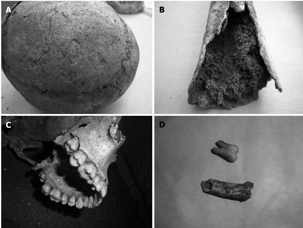
Figure 2 Research on the skeleton of the young girl. A: Skull vault showing excessive porosity; B: A particular of the femur showing cortical atrophy and spongio-sium bone hypertrophy, indirect sign of bone marrow hypertrophy, well preserved in 2000 years; C: A detail of teeth, showing basal dental enamel hypoplasia; D: DNA extraction: A tooth and a sample of bone from which DNA was extracted.